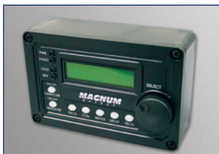
ME-RC shown mounted in bezel. Remote and bezel sold separately.