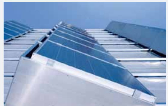
Flat roof system with MAGE POWERTEC PLUS modules

The high quality and stability of the system has been tested in various performance tests under real-life conditions. MAGE SAFETEC FLEX can withstand even the harshest wind and snow loads. A 10-year product warranty, together with planning and construction of the system in accordance with DIN 1055, further underline its quality and long lifetime.