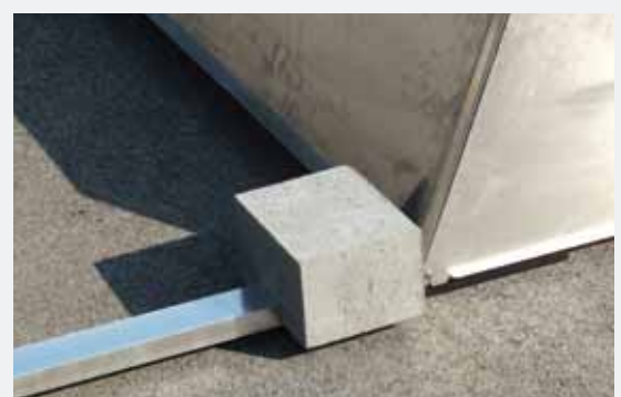
Ballasting at the periphery